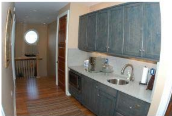
Second Floor Kitchen

---- Information herein deemed reliable but not guaranteed ---- Copyright 2005 Ocean County Board Of Realtors © 06/20/2009 05:01 PM