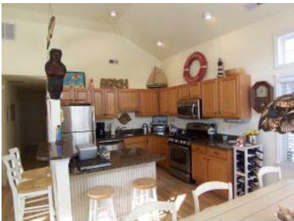
Granite Counter Kitchen