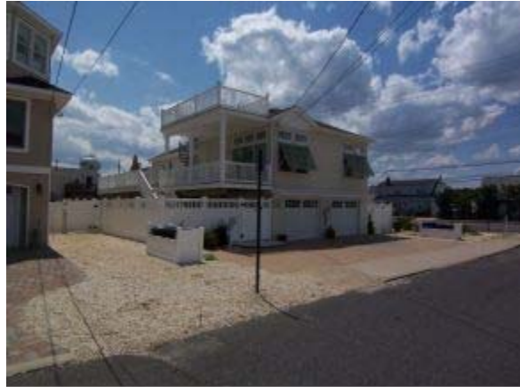
Spacious ProCell Deck Areas