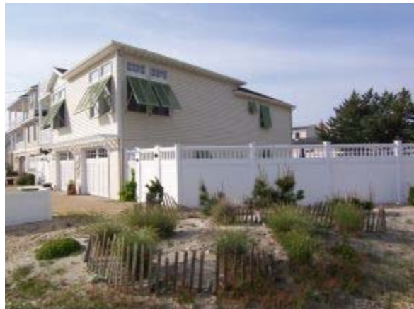
Totally Fenced Yard