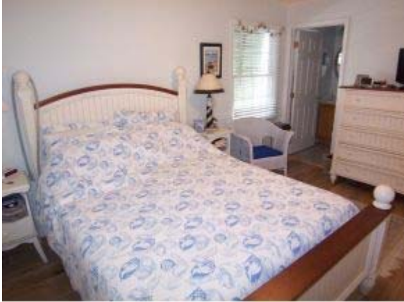
Master with Bath