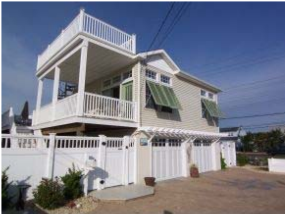
Ocean Bay Views

--- Information herein deemed reliable but not guaranteed --- Copyright 2005 Ocean County Board Of Realtors © 01/04/2009 12:01 PM