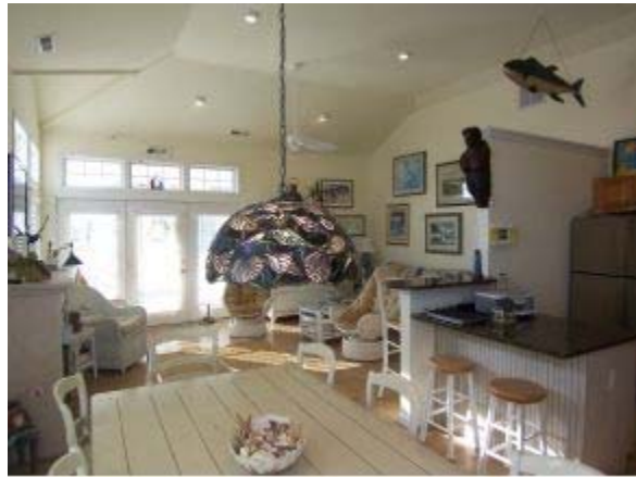
Cathedral Ceiling Great Room