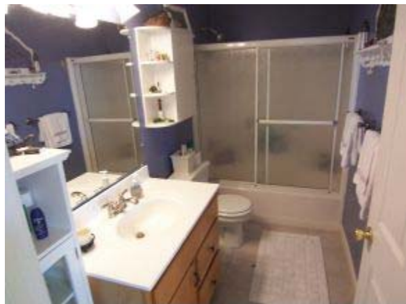
One of Two Full Baths

--- Information herein deemed reliable but not guaranteed --- Copyright 2005 Ocean County Board Of Realtors © 01/04/2009 12:01 PM