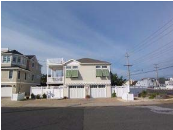
2-Car Garage wStorage Room