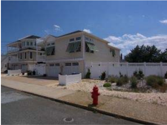
2 East Sand Dune Lane LBI