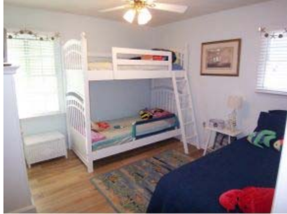
One of Three Bedrooms