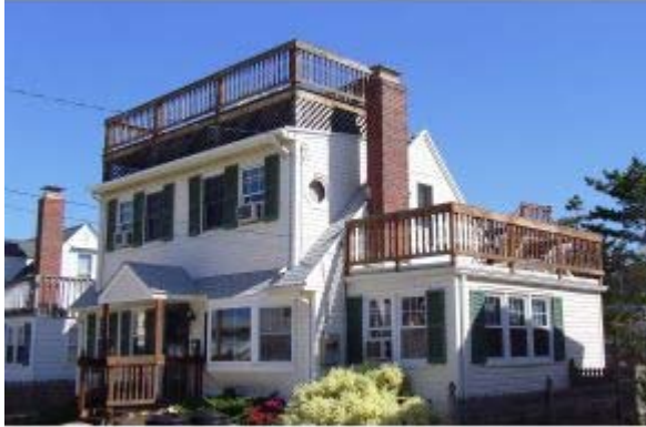
15 E. Sailboat