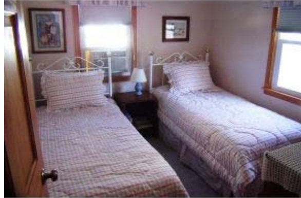
2nd Lower Level Bedroom