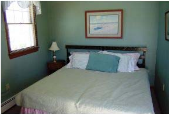
3rd of 4 Bedrooms