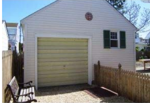
Detached Garage w Storage