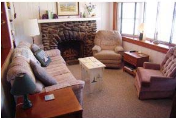
River Stone Fireplace