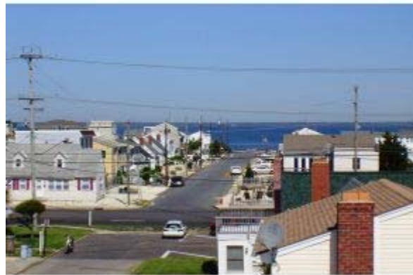
Bay View From Top Deck