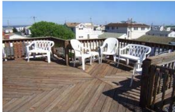
1 of 2 Roof Decks

--- Information herein deemed reliable but not guaranteed --- Copyright 2005 Ocean County Board Of Realtors © 03/01/2010 01:48 PM