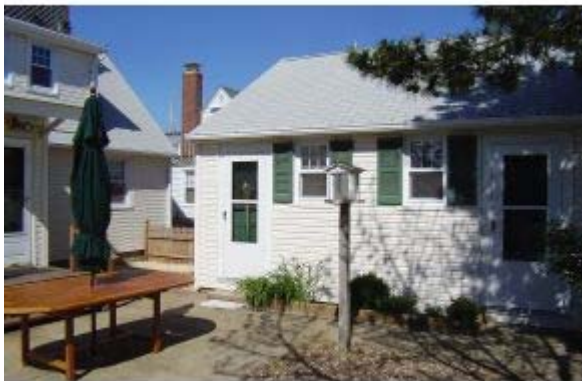
Private Rear Courtyard