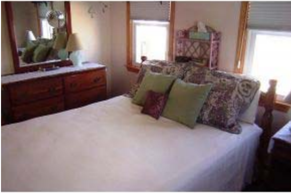
Lower Level Bedroom