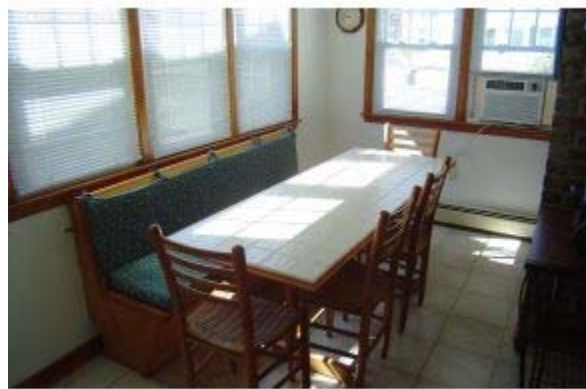
Separate Dining Room

---- Information herein deemed reliable but not guaranteed ---- Copyright 2005 Ocean County Board Of Realtors © 03/01/2010 01:48 PM