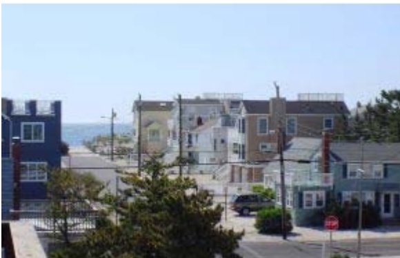
Ocean View From Top Deck