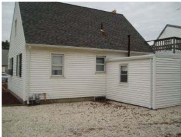
view from back