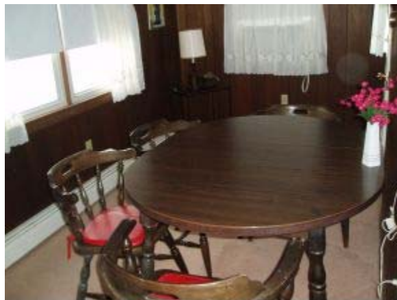
side dining area